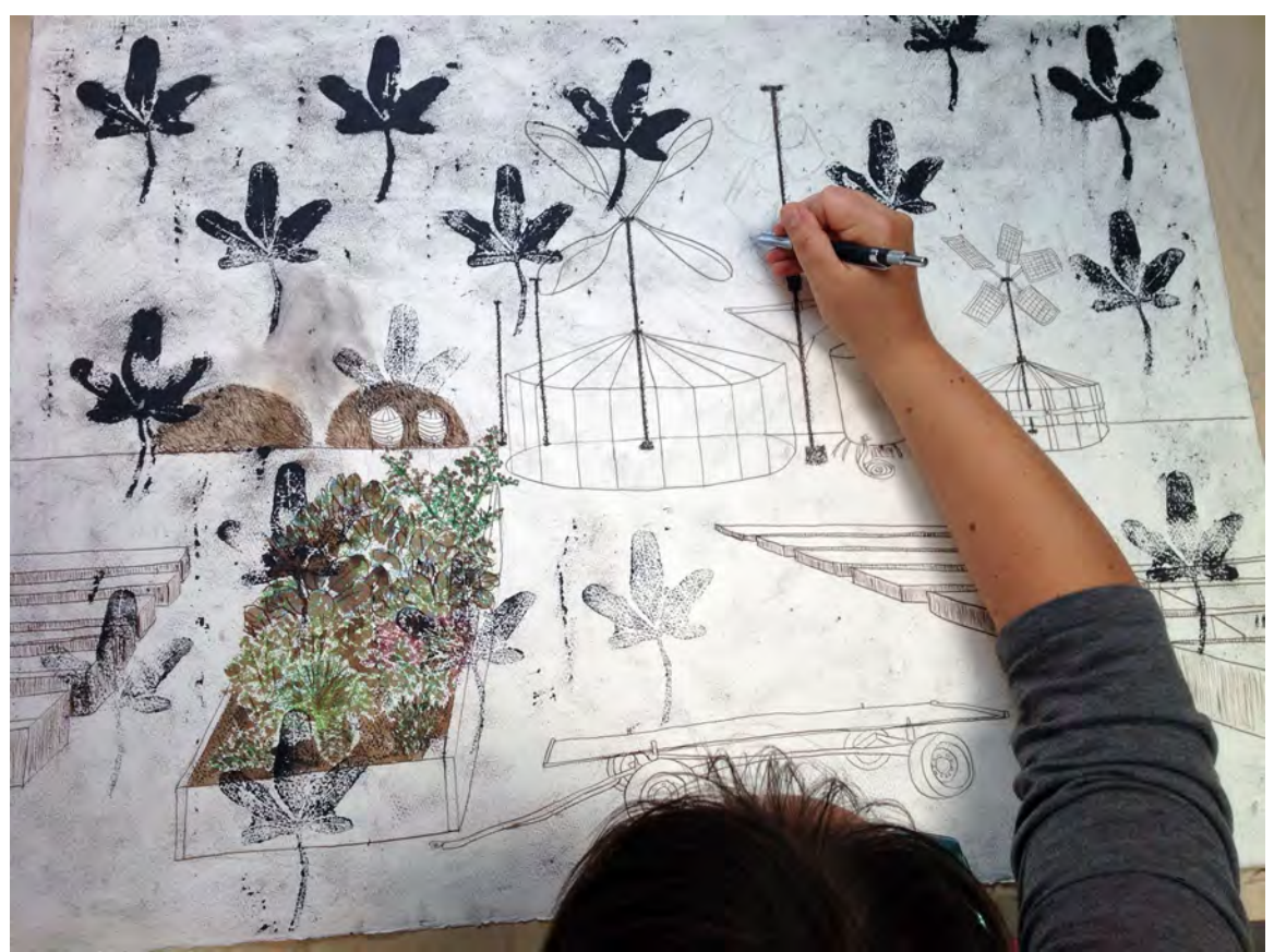
Figure 5 - Composition I: Green Go. Octavia Butler, a schoolteacher at Gomez Heritage Elementary School in Omaha, draws her rain chain design to capture rainwater and store it in a tank next to the rain chain pole.

I set up each composition with an ink line drawing of one of these places. Then I added a second layer using block prints that were icons for the project. Volunteers joined in to develop new layers by designing, drawing and painting elements of urban nature. Primarily they used artisan black walnut ink with soft and oil pastels.