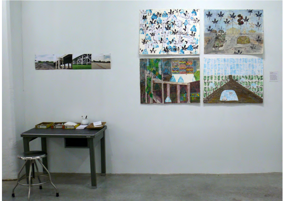
Figure 10 - Flock House exhibit at Bemis Center for Contemporary Arts includes inspirational photos, Compositions, and a drawing space for visitors to respond to the ideas of Green Go and Grow in urban spaces.

moved around the metropolitan area. We found the project actually changed the way we perceived urban landscapes. It led us to constantly revise them into urban gardens of every sort.