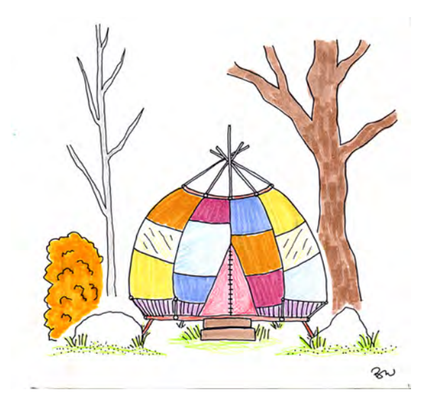
Figure 3 - Flock House in natural area, far from the city.

Our project team discovered that the idea of Flock House is extremely attractive to visitors. They associate Flock House positively to a variety of structures from their prior experience such as camping in tents, covered wagons, and playground equipment.