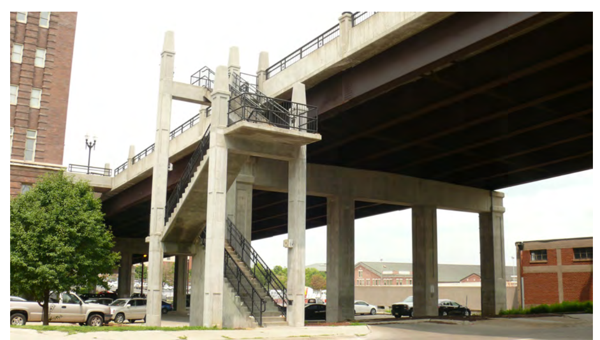
Figure 4 - This space under 10th Street, a block from Bemis Center for Contemporary Arts, has a staircase and pillared understructure perfect for vertical gardens.

The idea of a Flock House as a conduit for a more natural, gardened urban space did not communicate in the Flock House exhibit. Therefore, my colleagues and I focused on exploring how to create the idea of urban natural areas and food gardens that are enhanced by temporary Flock House structures. As we began to draw compositions, we started to think of ourselves as Dreaming Urban Nature.