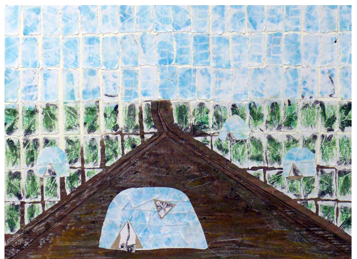
Figure 9 - Green Grow, Railroad Location combines a site where moveable gardens can grow around Flock House structures which volunteers, caring for the gardens, can reserve for their own creative endeavors.

Dreaming for this painting focused on places where moveable gardens could develop before they are transferred to Circus sites in urban locations.