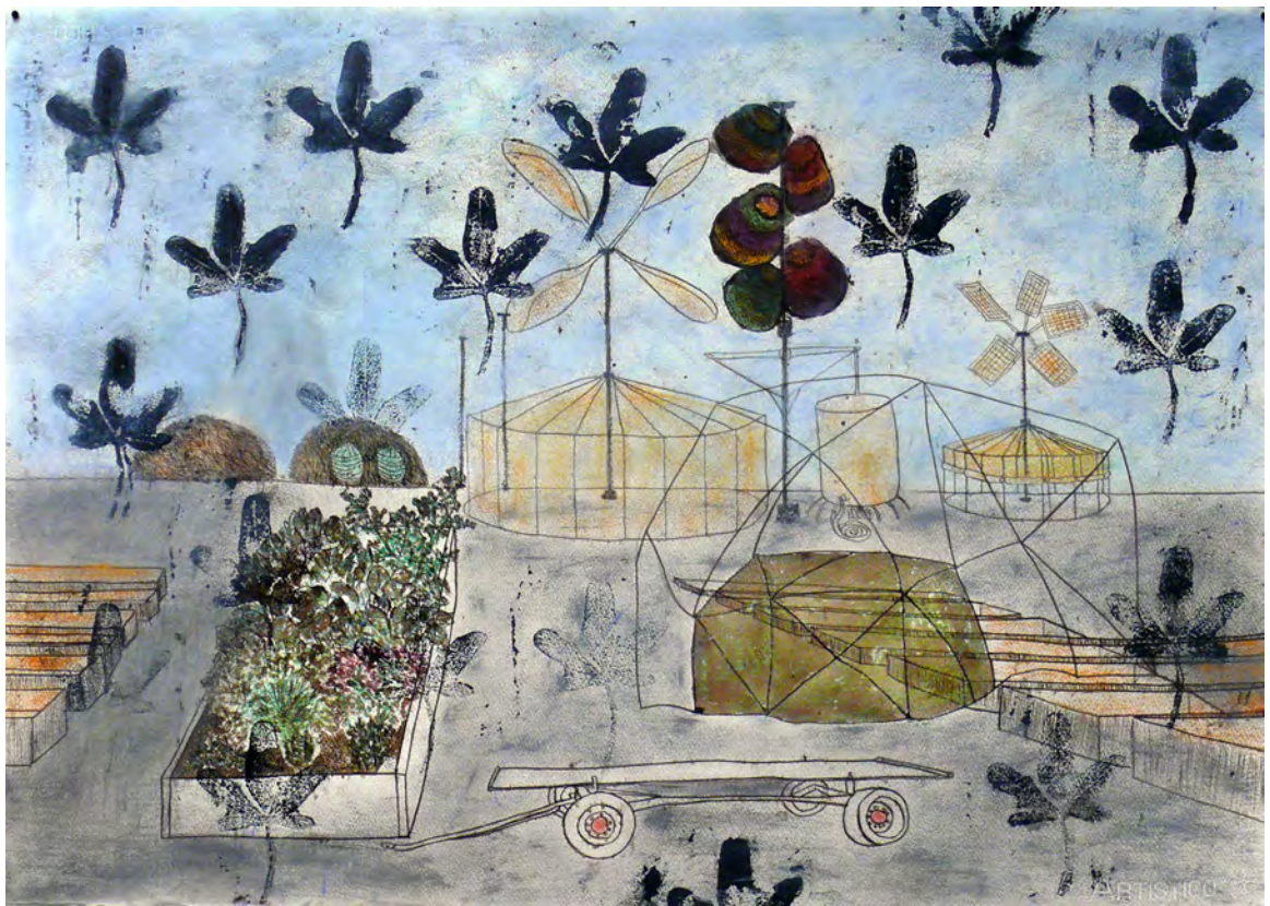
Figure 6 - Green Go Composition. The open structure, center right, is based on a Flock House drawing by a 4th grade visitor to the Mary Mattingly exhibit. It has an inner chamber and an outer protective structure.

The dreaming for this painting envisioned a verdant area replacing a dead zone. Here, seeds become plants, and plants are established in movable beds that will be taken to growing areas where they mature into fully formed gardens.